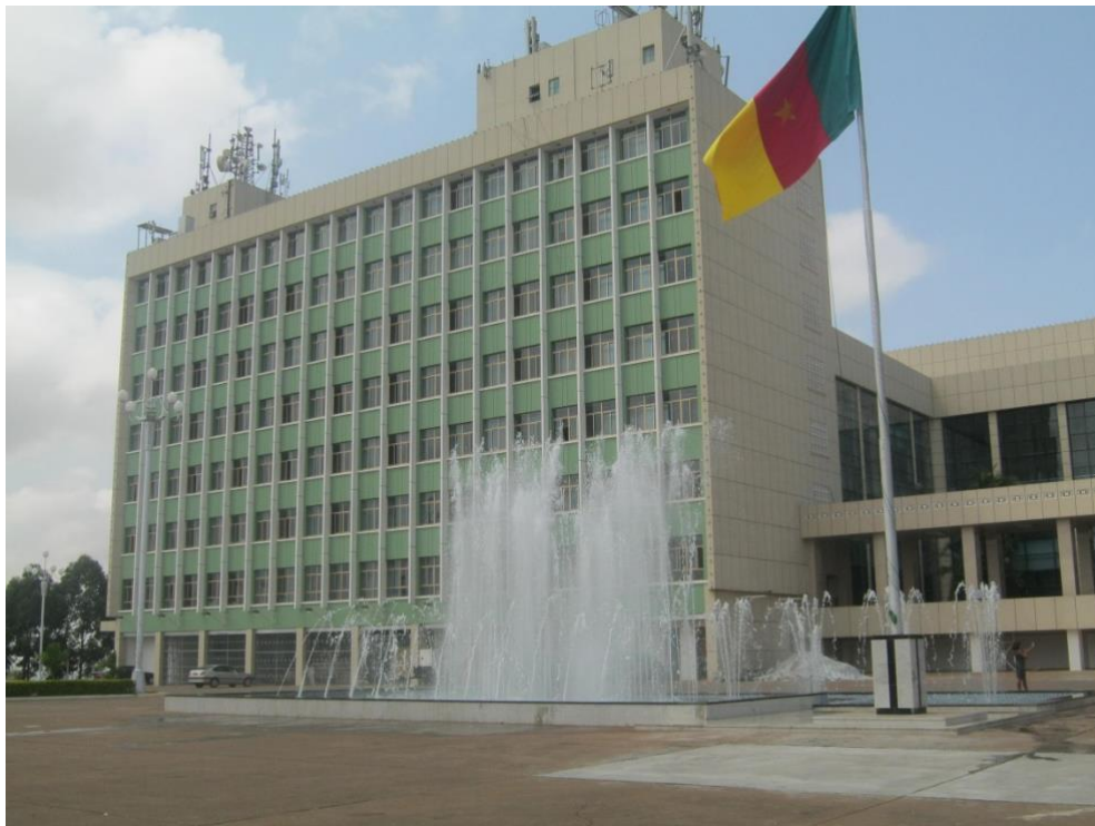
YAOUNDE CONFERENCE CENTRE Mount Nkol-Nyada, Avenue Carrefour du Palais

The Sub Sahara Spectrum Management Conference 2023 and APM23-4 will take place respectively from 3 to 4 August 2023 and from 7 to 11 August 2023, at the Yaoundé Conference Centre, located at the address below: